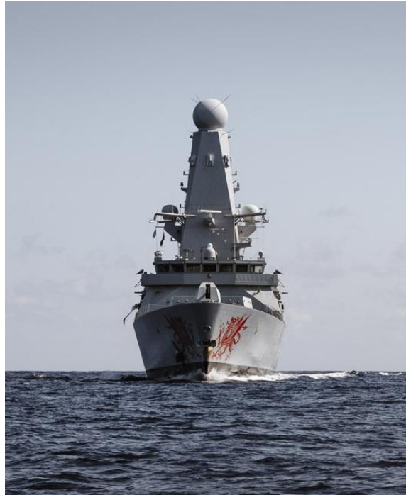
HMS Dragon at sea.

Chairman's Flag Hoist Future Speakers & Events Tamar and Spey remember British and American war dead at Pearl Harbor memorial Visit by HMS Astute to HMAS Stirling Historic dry dock becomes Scottish ship recycling facility The Maple Fund – a short history Some news from the Battle of Britain Memorial Trafalgar Night Dinner 2021 New Year's Lunch – application details CNOA Standing Order Form CNOA Member Application Form