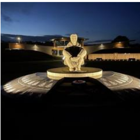
The Memorial Statue and The Wing at night