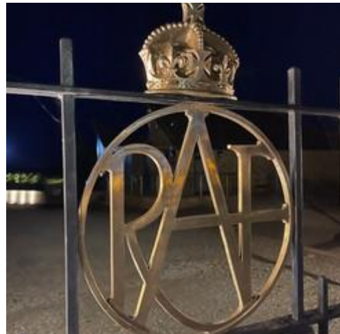
A detail from the 'Graydon Gates' which are now at the site entrance