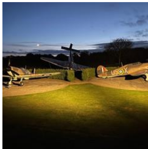
The Spitfire and Hurricane replicas together with the Stuka sculpture

During the lockdown many activities were undertaken to ensure that the Memorial stayed in the public eye. Whilst the rest of the site staff had to be furloughed, the site manager and his assistant remained on the payroll and embarked on a series of 'Facebook Live' events whilst the normal Sunday talks were converted to Webinars. New skills were learned very rapidly and the Trust's marketing team embarked on a hugely successful online appeal, backed by video messages from well-known celebrities and supported by the Daily Express, that raised a remarkable £80,000.