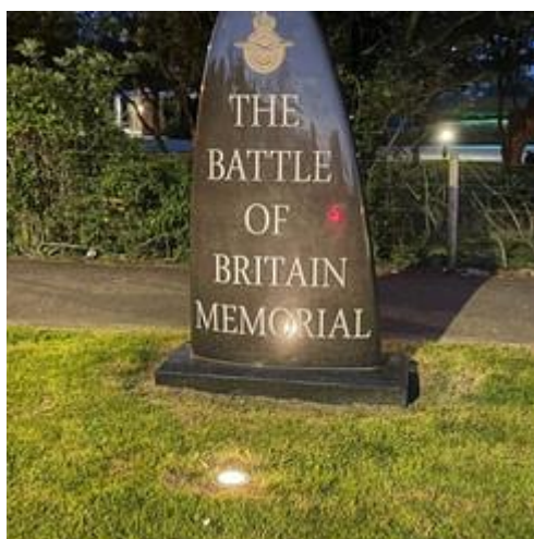
The replacement propeller blades at the site entrance

The Memorial site is now open again and can be visited without the need to book.