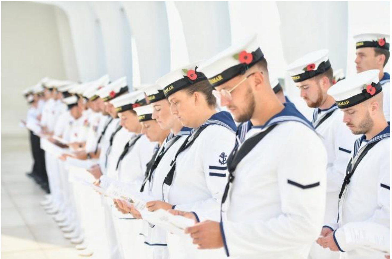
Tamar and Spey's sailors hold their remembrance service at the Arizona memorial

More than 40 men and women from the patrol ships honoured both Britain's war dead and the victims of the Pearl Harbor attack on the glistening white USS Arizona Memorial.