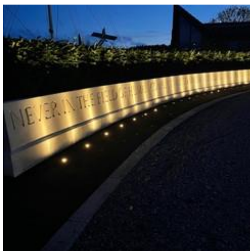
The Beaverbrook Wall

The Memorial site is now open again and can be visited without the need to book.