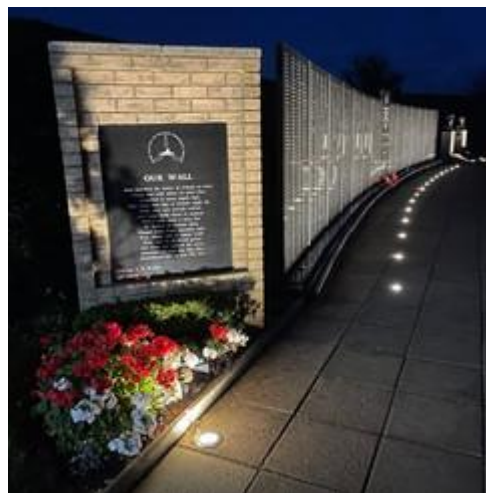
The Sir Christopher Foxley-Norris Memorial Wall

Many visitors find this is a great time of year for a quiet stroll around the site, thinking back to the events of 1940 and perhaps taking advantage of the autumn lighting to take photographs of the site before visiting the café for a warming drink and snack.